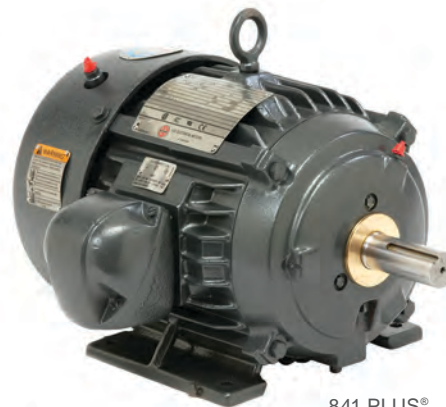
841 PLUS ®