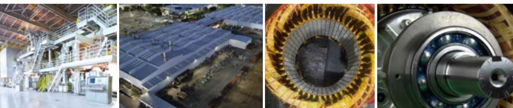
ABB has what it takes to help every industry and application reach new levels of efficiency and energy savings even under the most demanding conditions. Combining the best available materials with superior technology, our motors are designed to operate reliably no matter how challenging the process or application, and to have low life cycle costs.