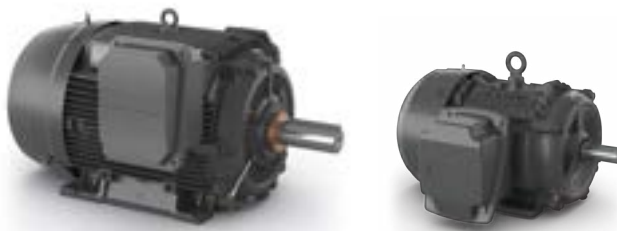
ABB NEMA motors web page