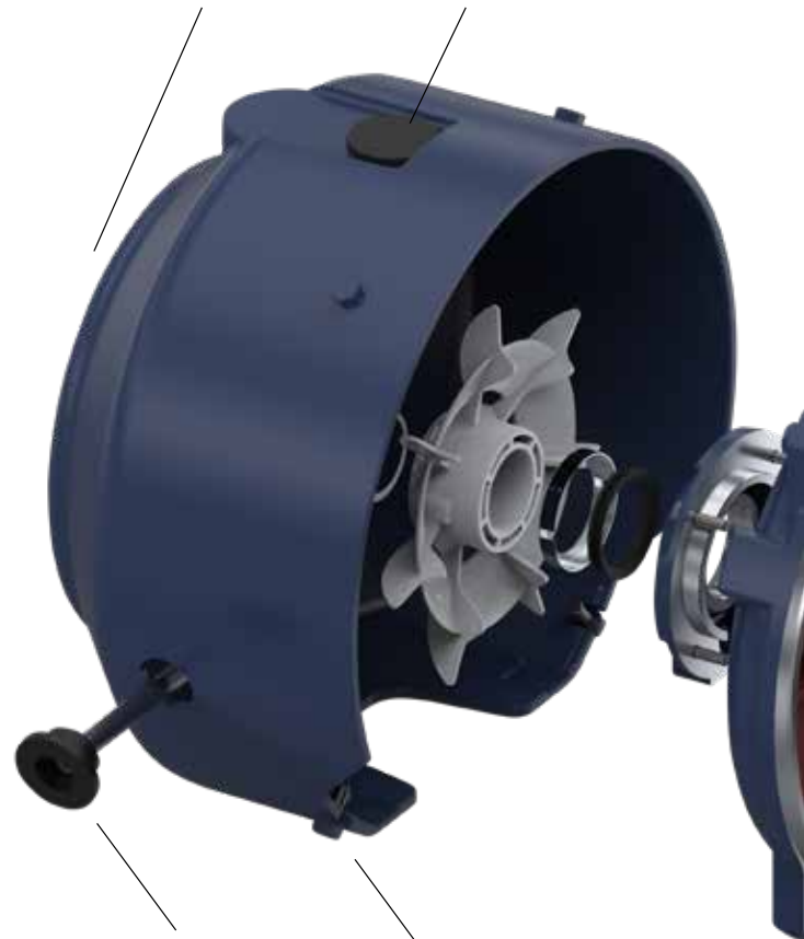
Outlet closing plug