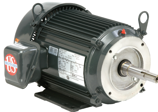
UNIMOUNT® 125 Motor